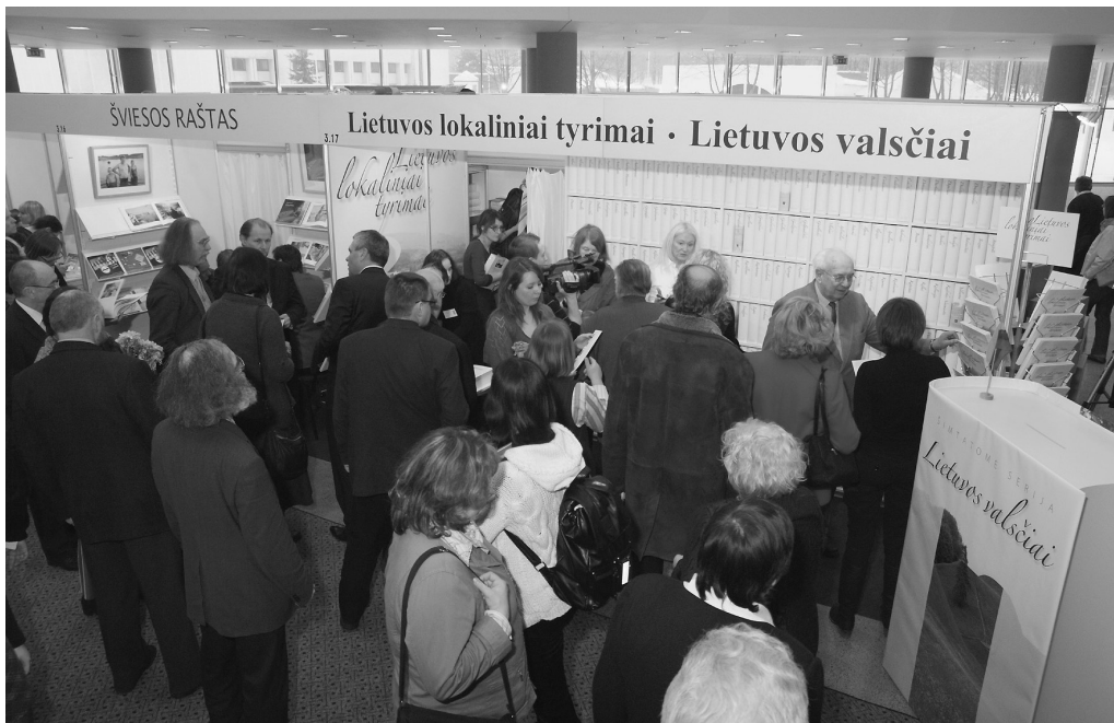
Although the presentation of “Lietuvos Valsčiai” series at the traditional Vilnius Book Fair takes place yearly, the visitors and hubbub at the stand seem to be commonplace. February 19, 2010.